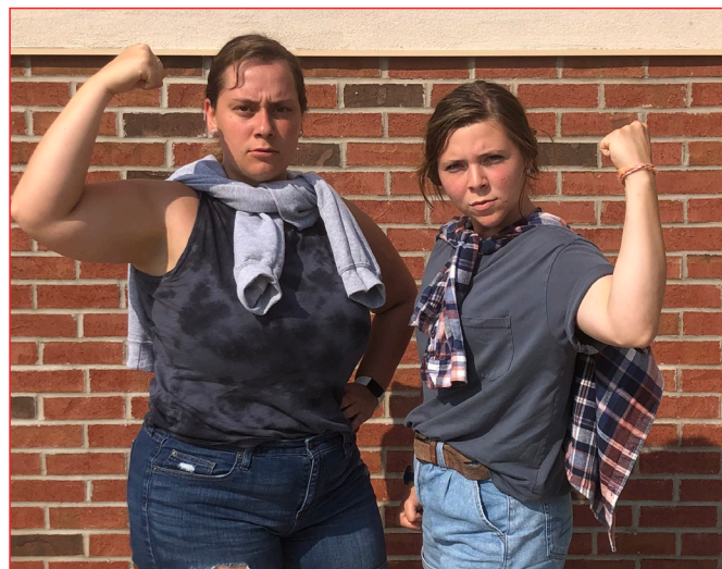
Help is on the way!

The secret code is: "WE MUST LET FUN PREVAIL!!!"