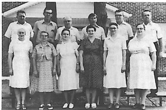
Summer School, 1977: Parents of RBI alumni