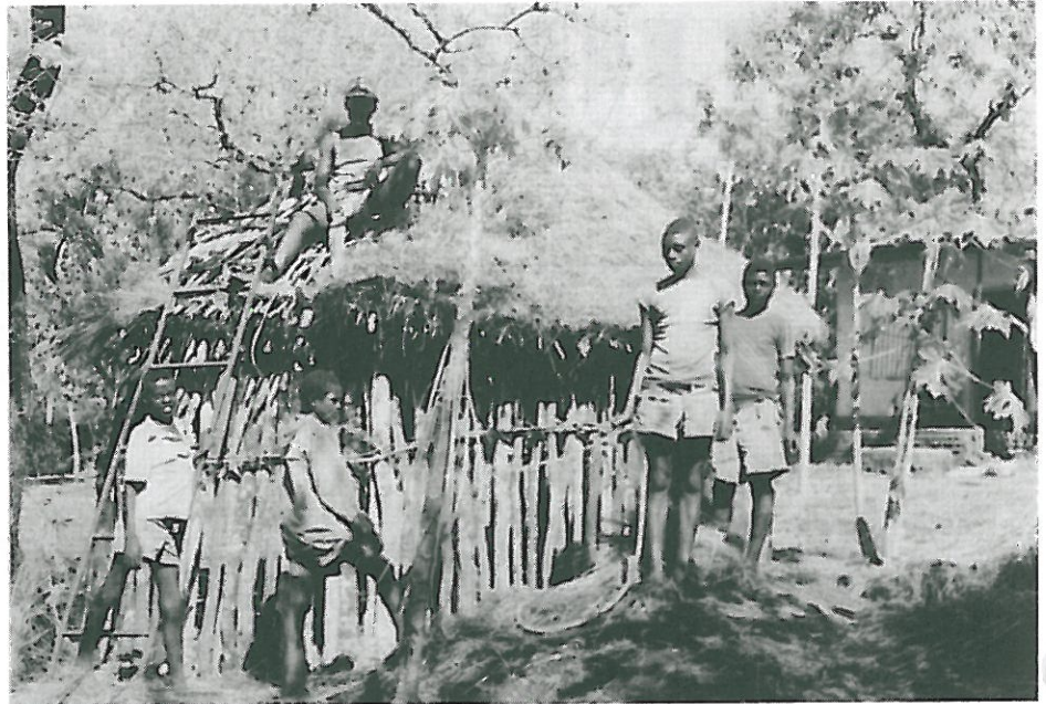
Dizi men and boys thatching the roof on a kitchen.

serious note, a highlight for her has been a relationship she has developed with the wife of a Korean embassy official, a new Christian with whom she began meeting for Bible