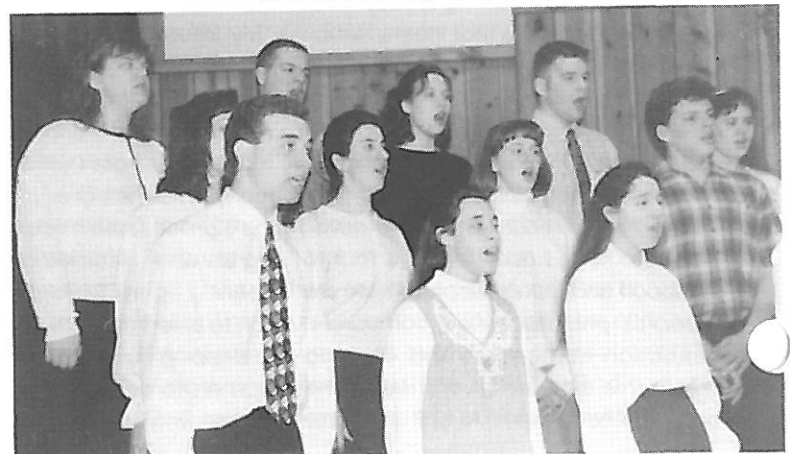
The Rosedale Chorale focused on the theme "Give Me Jesus"