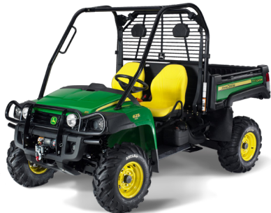
The much-loved John Deere Gator

Staff, watch out. These three campers have planned a surprise for you that this trustworthy publication will not reveal. In the meantime, enjoy this week of camp and be prepared to see these three finally getting to ride the Gator next year on Crew!