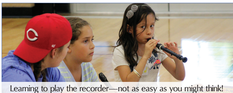
Learning to play the recorder—not as easy as you might think!

Campers, when you go into the library, look for the guy hiding in the office to the right, behind the window. You'll know him right away; he looks just the way a librarian should, surrounded by books!