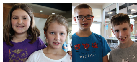
Faces of Choral Camp, day one!