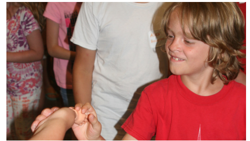
Tiny hand hug!

Despite the creepiness of the situation, most are enthralled with their new appendages. If you see any of these counselors, they will most likely run up to you, asking for a high five. It is probably best to go ahead and cheer them up and give them a high five. Thank you for your cooperation!