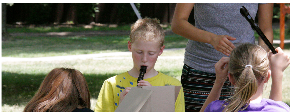
Some musical glimpses of Choral Camp