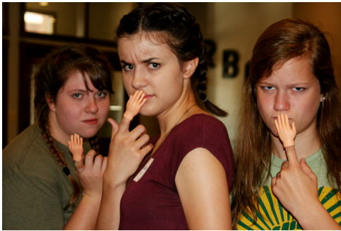
Counselors aren't sure how campers will respond to their tiny hands.