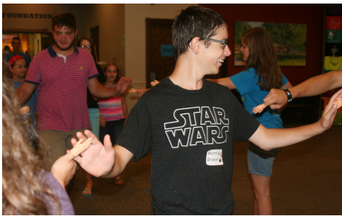
Campers come through! Yay, campers!