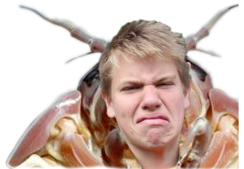
Crew members woke up to quite a surprise! Some might even call it Kafkaesque (see page 2).

(On a side note, see the next page for an insect-related vocabulary lesson!)