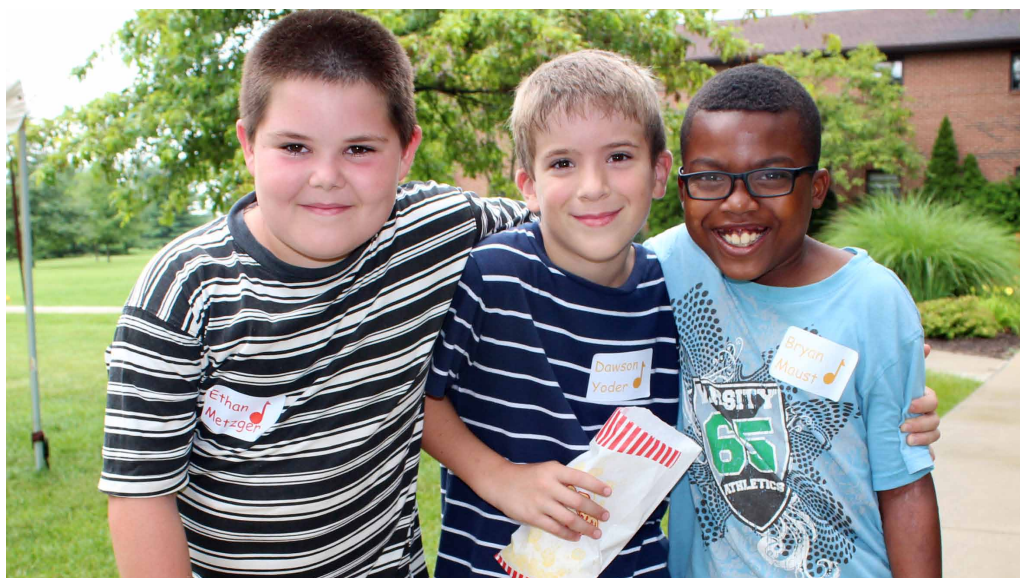
First day at Choral Camp, happy to be here! (More on page 2)

Looking forward to hearing you "sing joyfully" to the Lord!