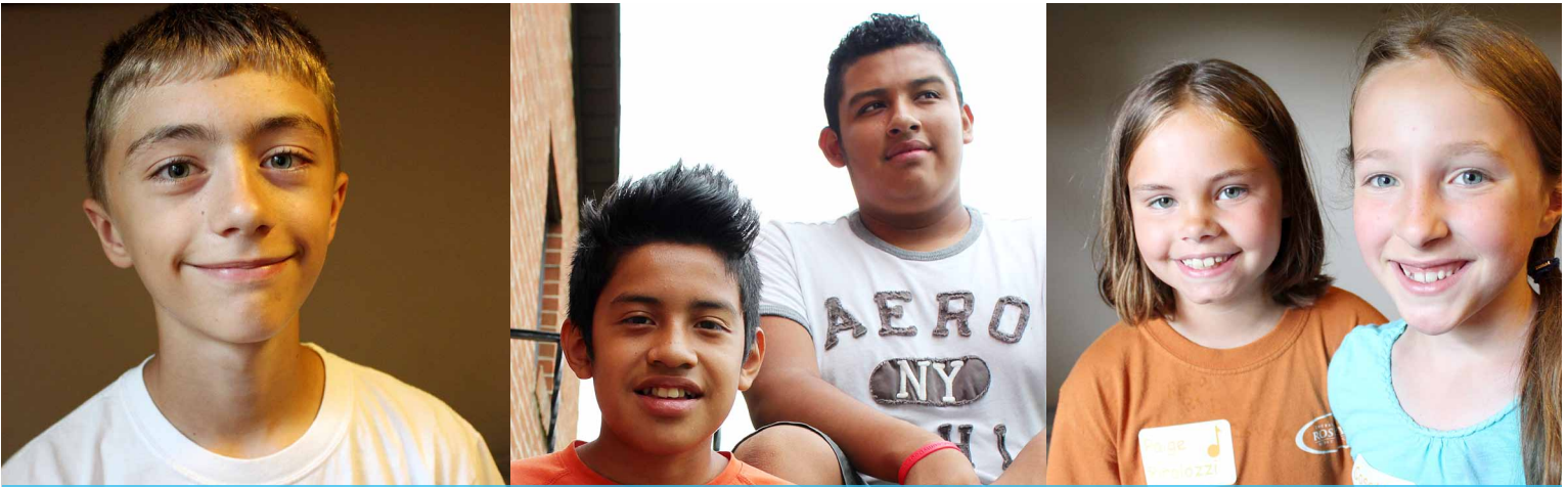
First day faces of Choral Camp: Settling in, feeling at home, ready for fun and music!