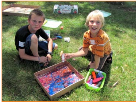
"Heat? What heat? We feel no heat."