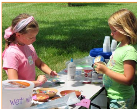
Making art outside — a quiet moment at camp.