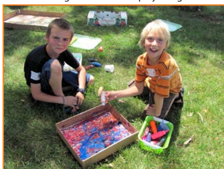
"Heat? What heat? We feel no heat."