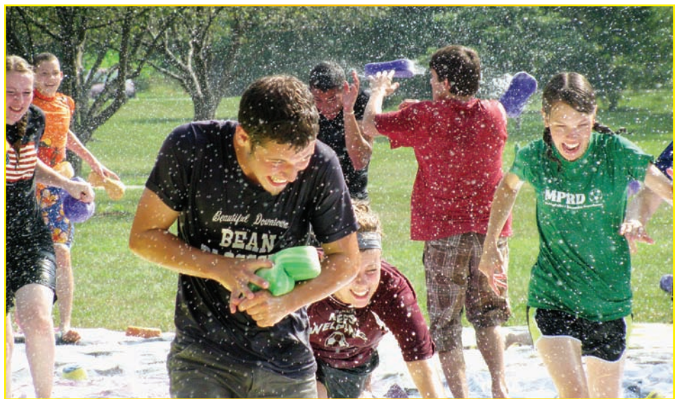
Campers keep cool by staying fully hydrated at events like Get Wet.