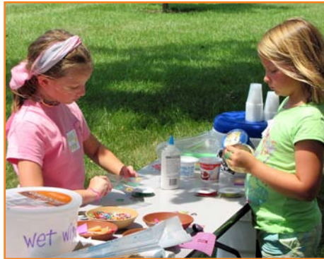
Making art outside — a quiet moment at camp.