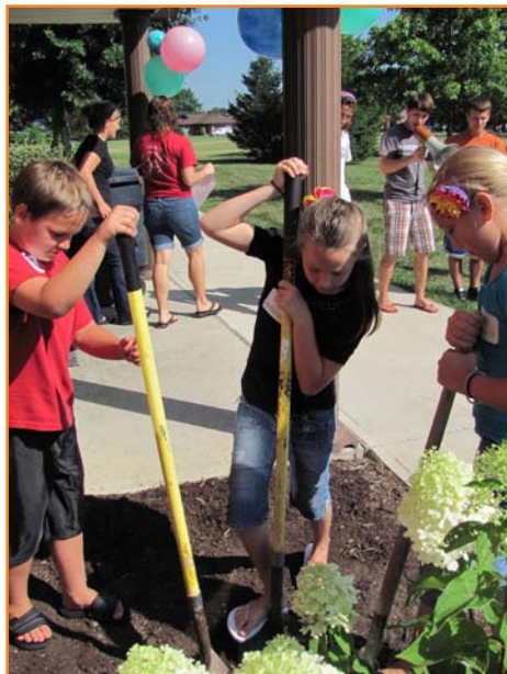
Planting the Choral Camp hydrangea.

However, messiness must be an acquired/learned trait. A downward trend is predicted (as campers get older).