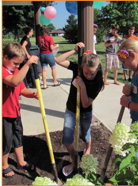
Planting the Choral Camp hydrangea.

Lunch: Sloppy Joe sandwiches, baked beans, tator tots, fruit slush, punch.