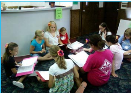
Choral Campers conduct a spontaneous practice session before choir even starts – way to go!