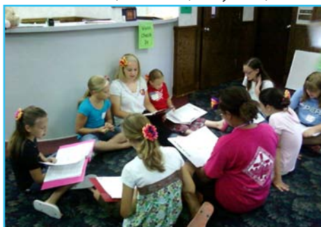
Choral Campers conduct a spontaneous practice session before choir even starts – way to go!