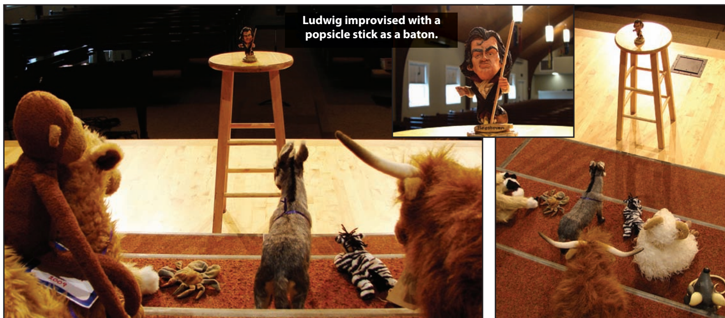
Ludwig improvised with a popsicle stick as a baton.

Above left, Beethoven conducts an impromptu choir in the chapel. Above right, the inveterate time traveler leads his animal choir in a rousing rendition of Choral Camp favorite "Festival Alleluia." Present and former mascots, along with a ragtag band of RBC animals, made up the choir.