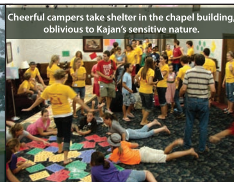
Cheerful campers take shelter in the chapel building, oblivious to Kajan's sensitive nature.