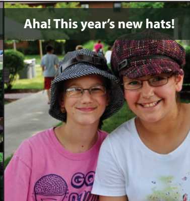
Aha! This year's new hats!