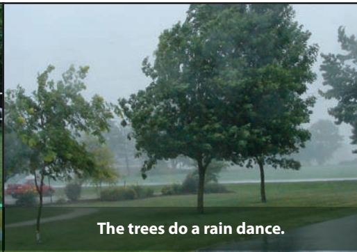
The trees do a rain dance.