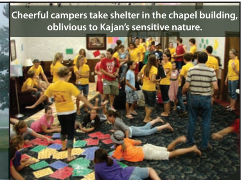
Cheerful campers take shelter in the chapel building, oblivious to Kajan's sensitive nature.