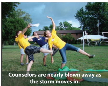
Counselors are nearly blown away as the storm moves in.