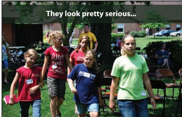
They look pretty serious...