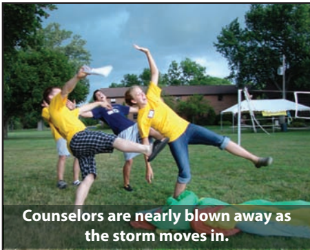
Counselors are nearly blown away as the storm moves in.