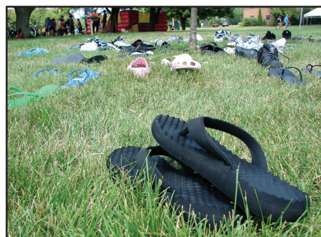
Abandoned shoes congregate in a make-shift camp, looking for their owners.