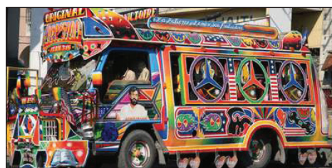
A Haitian bus, or tap-tap.

Independence Day in the United States is the 4 th of July. Haitians celebrate their Independence Day on January 1, the day they became free of France. Set off some fireworks on the first of January next year!