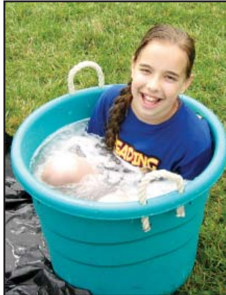
I know what you're thinking: that looks so relaxing!