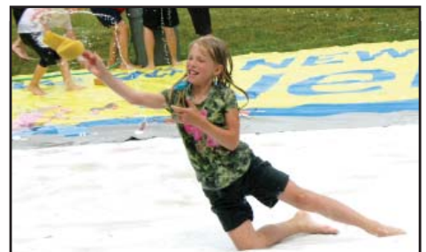
Maybe it will be a new Olympic Sport!