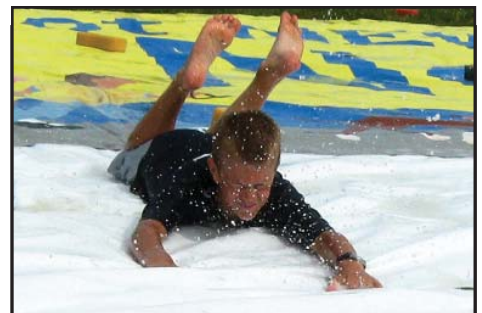
Campers braved the cold and wet conditions to experience the exhilaration of flying across the tarp.