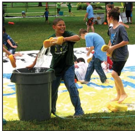
Look at his smile! He was obviously up to some sort of mischief (but then again, who wasn't?!). 😊