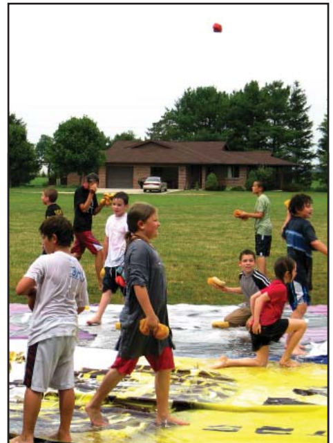
Campers continue with soap slide merriment while UFOs fly overhead