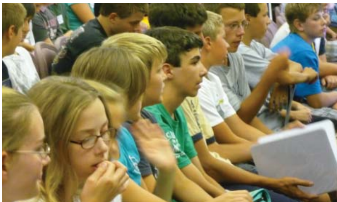
The new inhabitants of Rosedale

It had been quiet in the little town of Rosedale for weeks. All the dorms were empty. The neighboring corn fields had finally gotten the peace and quiet they dream of. Then it happened... Swirls of notebooks, violin cases, shaving cream, skates, and recorders came blasting through