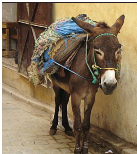
Hicham in Morocco, looking unusually brown.