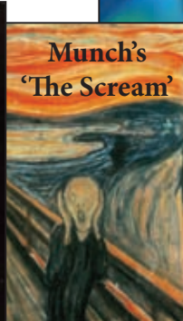
Munch's 'The Scream'