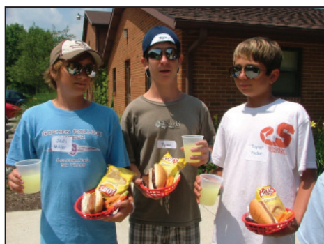
Above left: It's the food, dude.