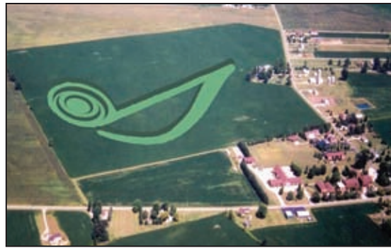
Aerial view of crop circle at Rosedale Bible College.

Preliminary reports on Sunday reported minor extraRosedalian activity, but a local hog farmer dismissed speculation on the