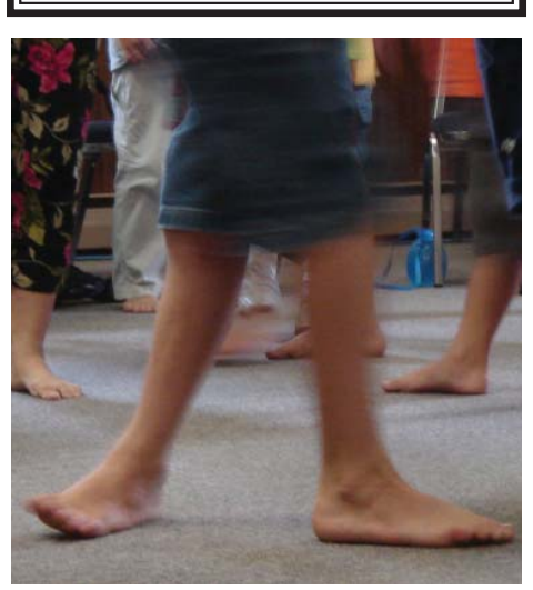
An actual, unretouched photo of a dance in Lynette Showalter's Culture class. The Record wonders if some students may need beginner lessons so they don't hurt themselves.

—Lynette Showalter, trying to improve the boys' opinions of the little Turkish coffee cups