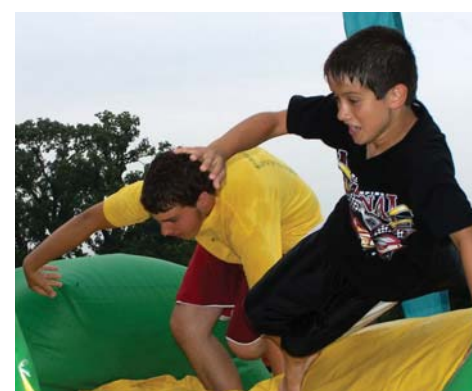
Boys having fun at SuperGames