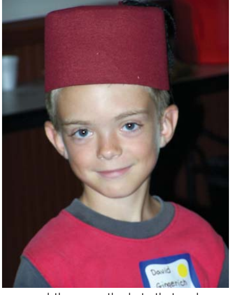
. . . and these are the hats that real men wear to dances in Turkey!