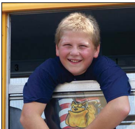
Just hangin' out. "I love this camp!"