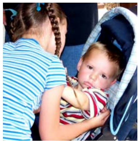
Apparently there is a limit to the number of hugs a young man can be expected to willingly receive on a hot July afternoon.