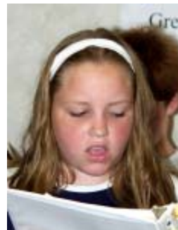
July 11, 1993