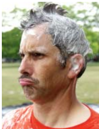
Does he disapprove of stretching?