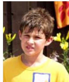
July 12, 1995