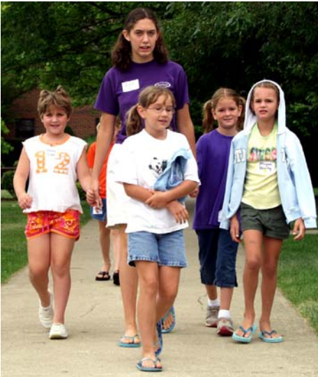
The campers are coming! The campers are coming!