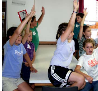
Campers patiently requesting to have their table go to the food line next