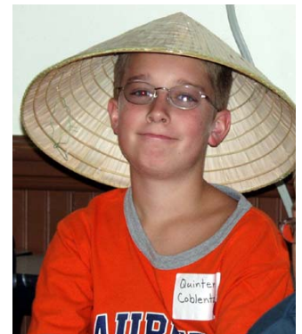
Intercultural learning or protective headgear?

An investigation has been started to determine if the head problems are somehow related. Did all four of the patients eat hamburgers for lunch?