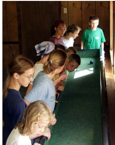
Bumper Ball, a very safe and fun game if it's players use their heads!

Choral Camp has, by the grace of God, always been free of serious injuries to campers and camp staff. Safety has been high on the list of concerns during camp planning, leading the directors to remove “bumper ball” or “carpet ball” (the game where billiard balls are rolled at varying speeds in a carpet-lined wooden trough) from the original list of recreational options. The Record has learned that the directors caved under an intense lobbying effort by campers and camp staff and restored the game to its rightful(?) place in the game room.