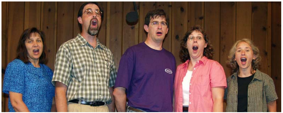
The music teachers on Thursday afternoon. Why are they all singing ‘Hallelujah’?