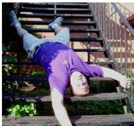
No one fell down the stairs or onto their drumstick.