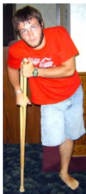
It started with a broken toe, but after 8 Alevé's in one day . . .