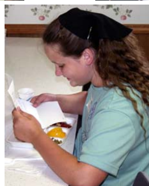
Ti Ta Ti Ta Ta Ta-a-a Shake the Papaya Do-o-wn

From Monday at 1:02 A.M. to Tuesday at 5:49 P.M., 53 e-mail messages were retrieved from the choralcamp mailbox.