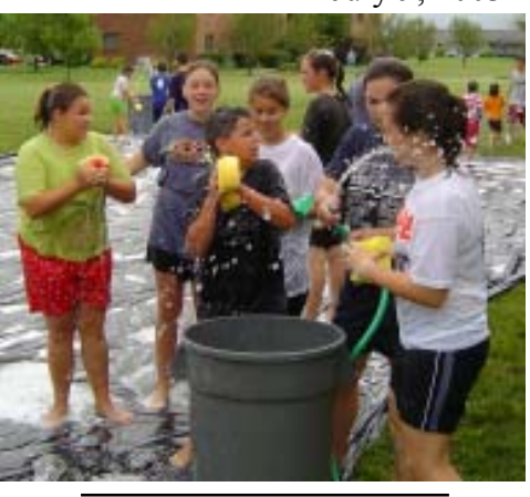
66My sister sleepwalked into the counselor's room 99