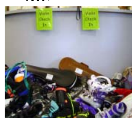
Do choral campers know a violin from a pair of skates??