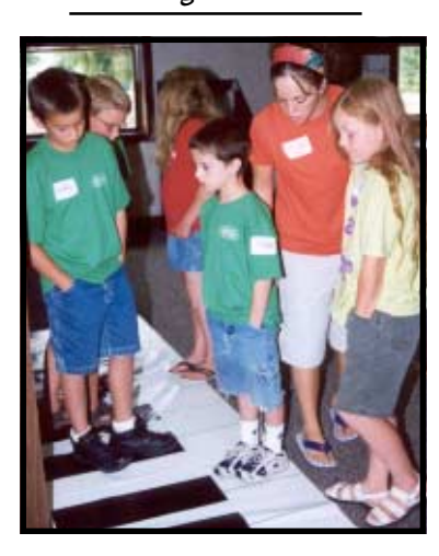
Theory and practice class in the library

And saves us from destruction. The devil do us bad— Tries to make us mad; He tricks and cheats all. He thinks he's set to fight, But God will stop him With His might!