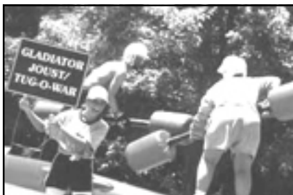
This game is like many of the games you will play this afternoon.

Other events include: wacky trikes, water tag, water balloon launch, punctured drum relay, strata ball, a giant six foot shot put, paradise island, chicken juggling, and asteroid alert.