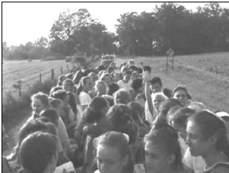
Wednesday's hayride took campers by many Madison County corn fields.