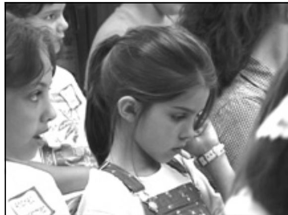
A camper practices vocal skills in her TAP class.