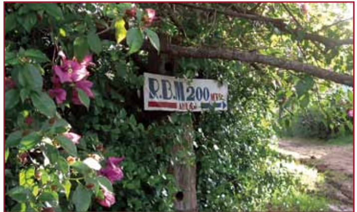
A sign points the way to Regions Beyond Ministry Bible College near Thika, Kenya.