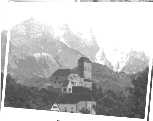
The Austrian Alps

May 4 —Visited the Eiffel Tower in the morning; split into smaller groups to explore other sites of interest in Paris such as the Arc de Triomphe (Triumphal Arch) and the Basilique du Sacre Coeur (Sacred Heart Basilica); left Paris en route to Switzerland in the afternoon, stopping in Dijon, France, for the night