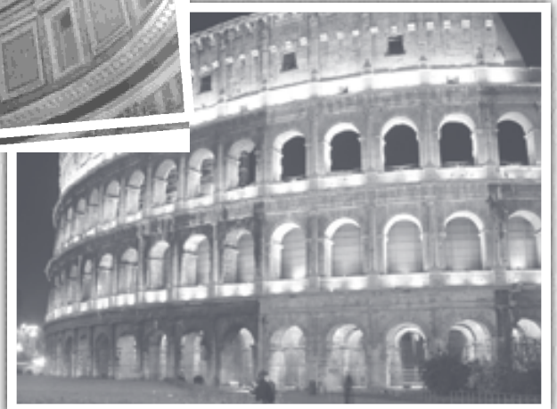
The Colosseum, Rome