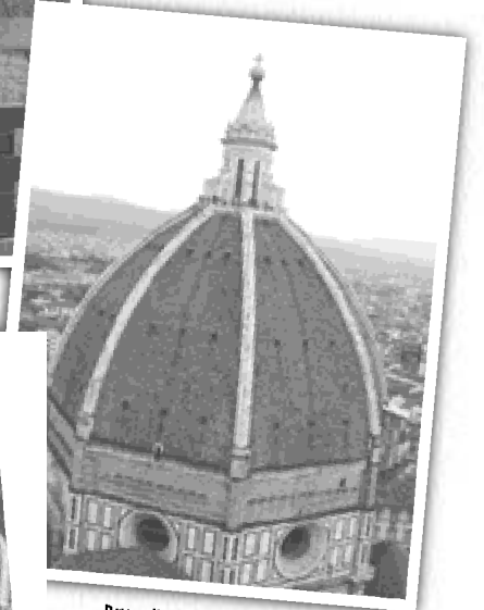
Brunelleschi's Dome, Florence