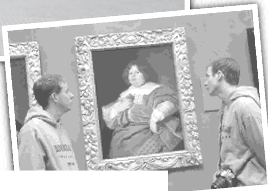
The Rijksmuseum, Amsterdam