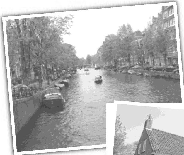
Canals in Amsterdam