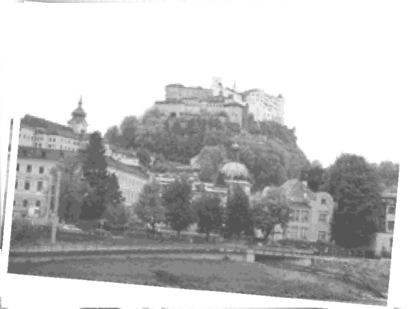
Hohensalzburg Fortress, Salzburg