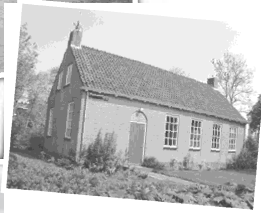
Anabaptist meeting-house, Netherlands