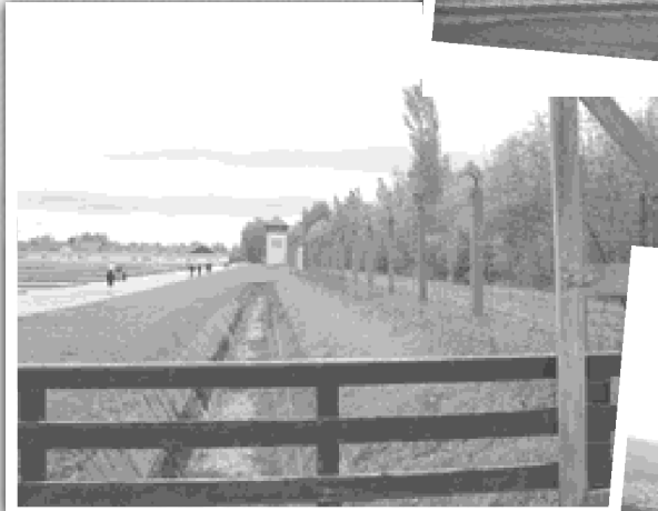
Dachau Concentration Camp, Germany