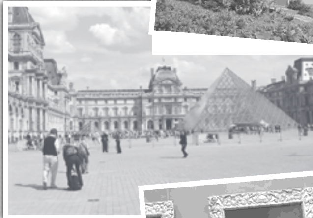
The Louvre, Paris