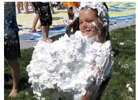
CHORAL CAMP CREW CATCHES CLOUD!

Preview of tomorrow's exposé (big word for shocking story): Rumours persist that the Crew (the scary, scary Crew) are up to no good. Find out more tomorrow!