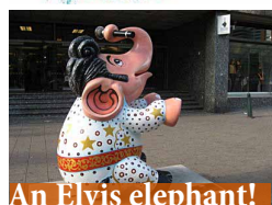
An Elvis elephant!

"Oh, you just can't Handel my awesome awesomeness, Ludwig!" responded old Georg.