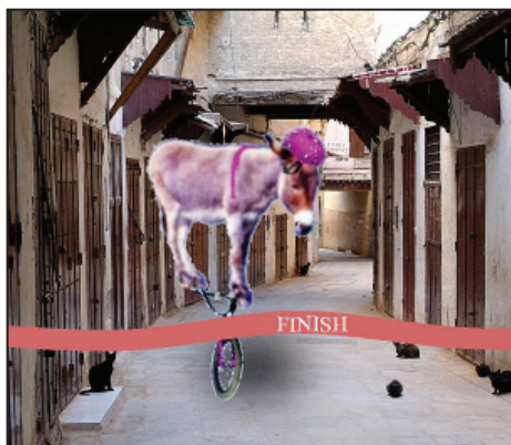
Misham crosses the finish line in a blaze of glory and cats. The cats are kind of hard to see.

stomped their hooves in amazement. They all turned away and covered their eyes in shock. But when they uncovered their eyes, their jaws dropped in astonishment.