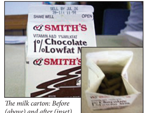
The milk carton: Before (above) and after (inset).