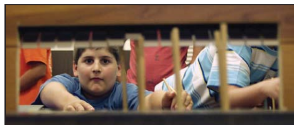
An exit-point view of the Miller Magic Music Box

A1: "A cartoon." A2: "He used floodlights."