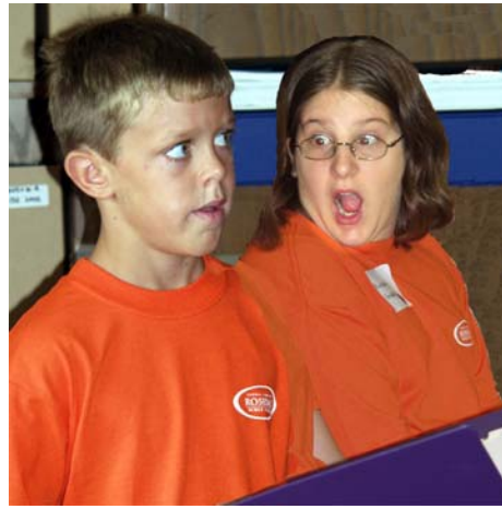
Opera comes to Choral Camp!