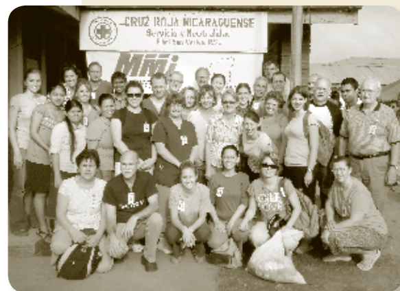
The 2009 Eye Project Team to San Carlos, Río San Juan, Nicaragua.