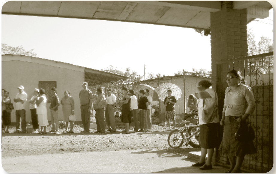
It wasn't unusual for 100 people to be waiting in line when the clinic opened up each morning.