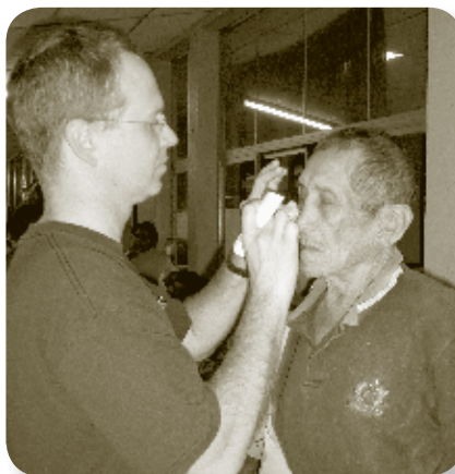
The surgeons checked on their patients the day after surgery in post-op.